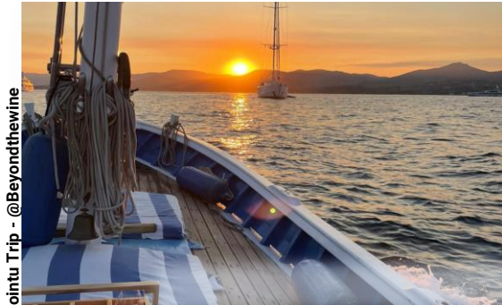
Pointu Trip - @Beyondthewine