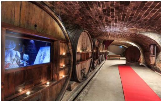
Château Saint Martin

An interactive and a sensory journey through a playful adventure inside a vineyard where wine and spirits production coexist.